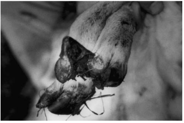
Fig. 10 Loss of horn capsules at the front legs of a lamb

Loss of hoof shoes (shoeing out) occurred in the 'Hinterland' population affecting 9 of 90 animals (10%)