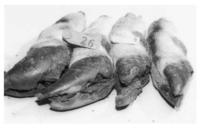
Fig. 1 Diseased and healthy claws from the same mouflon

The first method for capturing free-ranging mouflons is the use of a catching lattice, a kind of a kraal. We used a round or oval wooden or netting wired fence, 15 m in diameter with a catching funnel on one side and a gate vis-à-vis.