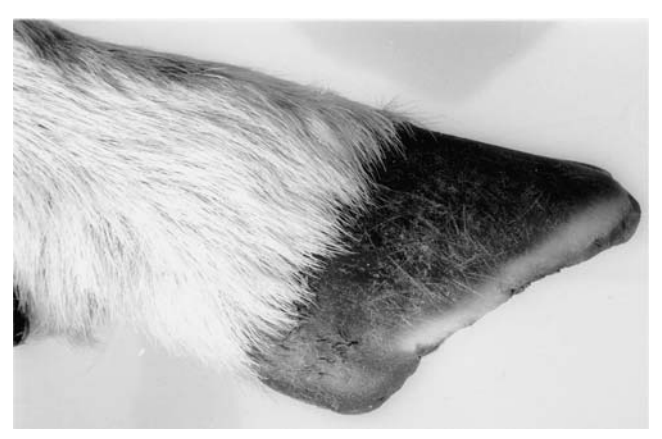
Fig. 3 Lateral view of a normal healthy horn shoe from a mouflon

times) and examination were performed. Running water was temporarily available. Because of the danger of oversupply of nutrients and subsequent indigestions and bacterial infections ( Clostridia ssp.) of the intestinal tract, mouflons received only 1–2 kg of hay pellets or cobs per animal, while additional drinking water was supplied ad libitum. Feeding costs ranged between were €0.40 and €0.80 per animal and day (Table 1).