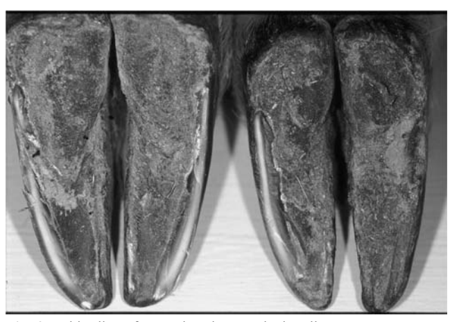
Fig. 9 White line after cutting the marginal wall

containing 3% formaldehyde. Suspensions were mixed, and to check whether all bacteria had been killed, a new subculture agar was incubated. The density of the bacterial suspension was set at no. 3 of McFarland's scale (Burkhardt 1992).