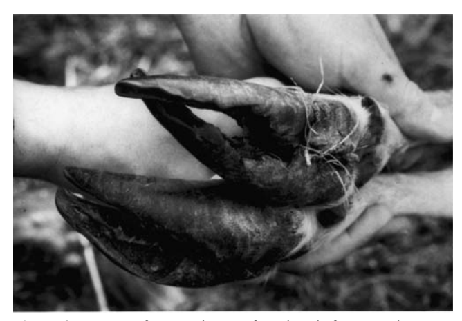
Fig. 7 Over-grown foot rot claws at front legs before resection

Vaccine production and costs of vaccination