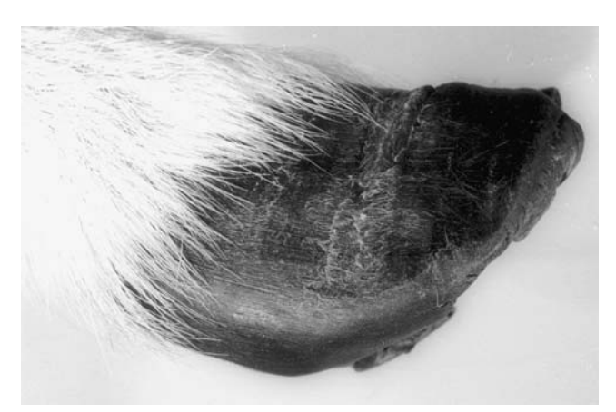
Fig. 4 Wall and sole of a mouflon hoof with beginning foot rot

Focal treatment of infected and wounded toes was done by extensive resection of all altered parts of the horn capsule, taking care to preserve the physiological shape of the horn shoe (Figs. 3, 4, 5, 6, 7, and 8). After the resection procedure, the whole hooves were wetted with an antiseptic fluid (Kodan®-Tincture). Altered claws with excavations, florid processes and fistulas were treated by an additional antibiotic infiltration. A procaine penicilline solution of 5.0 ml (Procain Penicillin G<sup>®</sup>) was injected into the toes at the plantar area of the inter-digital cleft. A control and if necessary a second systemic and/or topical treatment was performed after 2 or 3 days. Four to 6 weeks after the first resection, a final restoration of the physiological shape of the horn shoes and an inspection whether white lines of unaltered shoes were completely intact were performed (Fig. 9). After this procedure, the animals were released.