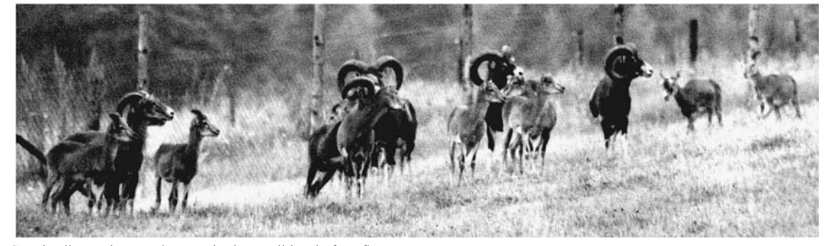
Fig. 11 Caught diseased group in poor body condition before first treatment

during the time in the quarantine corral. The vaccine was well tolerated; only small subcutaneous reactive nodes could be seen for approximately 2 weeks.