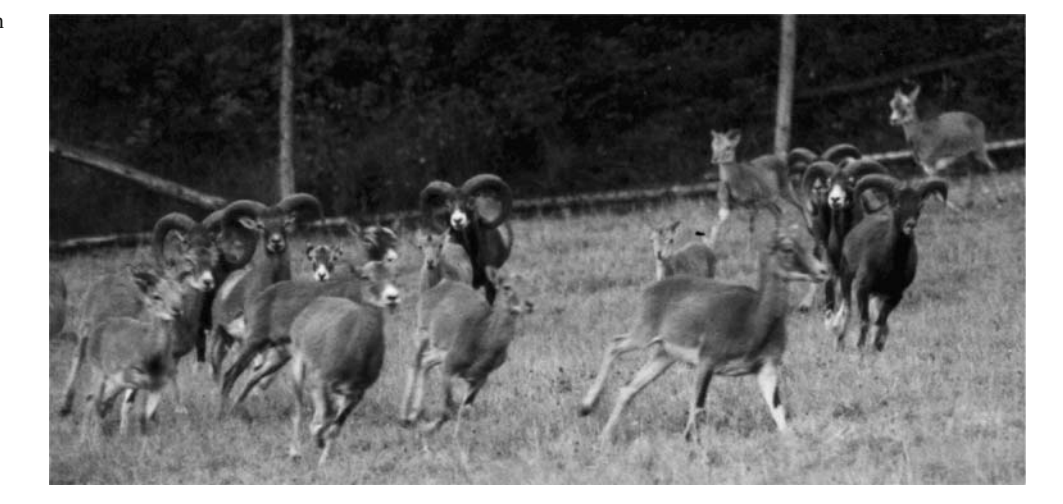
Fig. 12 Same group as shown in Fig. 11 4 weeks after first treatment in the quarantine corral

The present study demonstrated distinct differences of treatment demands and survival success between affected mouflon populations. Differences in survival success between the Hinterland population and the other two treated populations were significant. These differences probably do not depend on disease-related or population factors such as more resistant foot rot agents or a higher number of mouflons with an insufficient immune status. Rather, in the Hinterland population, catching and keeping the animals were comparatively ineffective resulting in a lower proportion of the population receiving two vaccinations. This indicates that an effective system of capturing and treatment is crucial for an effective control of foot rot in free-ranging mouflons. Furthermore, mouflon hunters have to suspend their hunting activities during the treatment period to avoid the inadvertent shooting of treated and vaccinated animals.