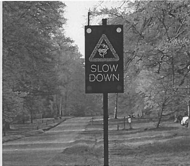
Interactive signage was deployed for the first time this year in Britain.

determine whether deer do actually tend to delay crossing longer after traffic has passed where such devices are present, and also whether any reaction elicited differs either between the devices on test and/or between our different common species of deer. A similar approach to monitoring is being utilised on the B1106 through Thetford Forest in Suffolk, where the County Council is interested in assessing whether rumble strips, in addition to potential reduction of driver speeds, may also have some effect in alerting deer to oncoming traffic 5 .