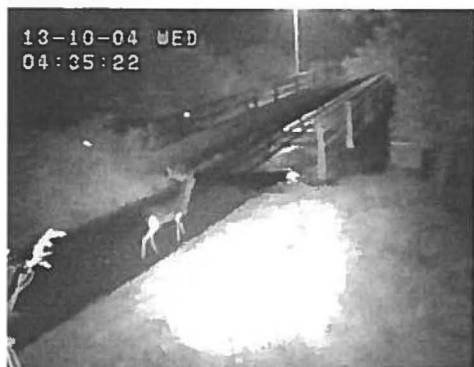
This deer was prepared to use a 4m wide bridge across the M25.

Trial sections with these devices were established at the end of last year on the B4506 at Ashridge Forest in the Chilterns supported by the Three Counties Traffic partnership (Hertfordshire, Buckinghamshire, Bedfordshire) and also on the A39 near the Quantock Hills by Somerset County Council. Two further trials with the Ecopillars will commence on two trunk roads (A38 in Devon and A49 in Herefordshire) this spring commissioned by the Highways Agency. To study their effectiveness, rather than merely waiting for reports of changes in accident statistics over future years, the local funding authorities are providing support to enable us to undertake behavioural monitoring of these trials using periods of day/night digital video surveillance, the latter being used to