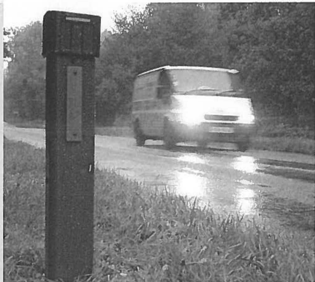
The Ecopillar incorporates acoustic signals and optical flashes from reflected headlights.