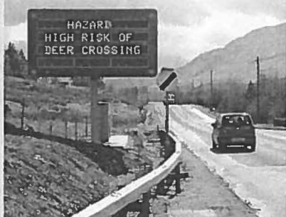
Variable messaging on the A835 in Scotland.

results of the work should also be available later this year.