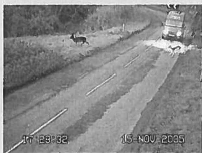
Above and below: Video surveillance is valuable in identifying deer behaviour and the effectiveness of accident reduction measures.