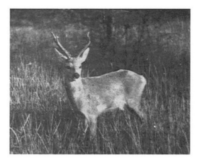
FIG. 1. Male Capreolus pygargus from Tien-Schan area.